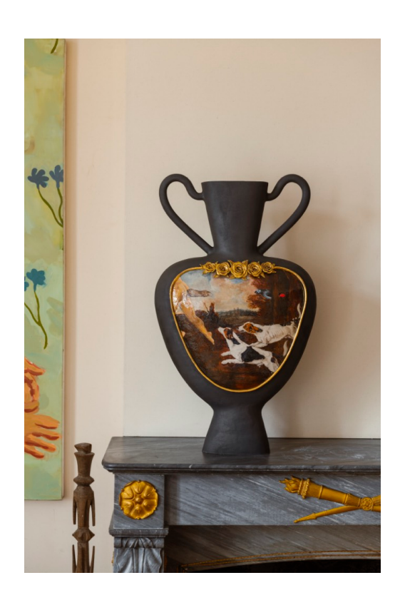
ZUZANA SVATIK BARKING UP THE WRONG TREE January 12 - February 11, 2023