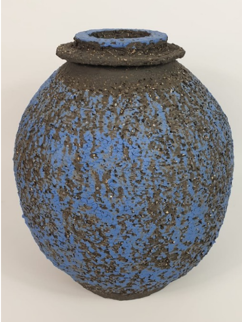
Shoshi WATANABE Untitled, 2020 Stoneware & Glaze