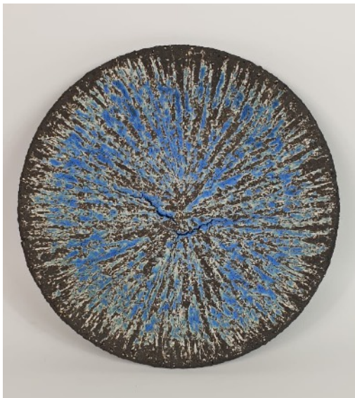
Shoshi WATANABE Untitled, 2020 Stoneware & Glaze