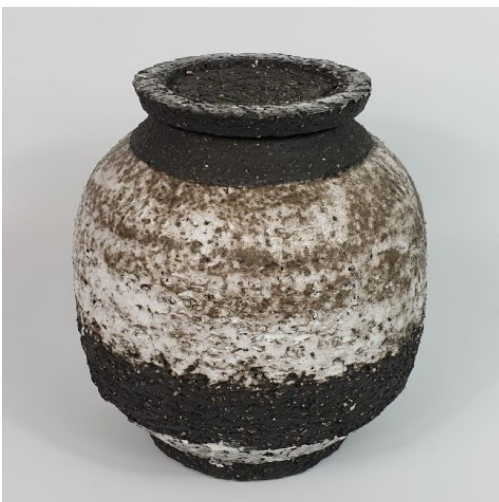
Shoshi WATANABE Untitled, 2020 Stoneware & Glaze