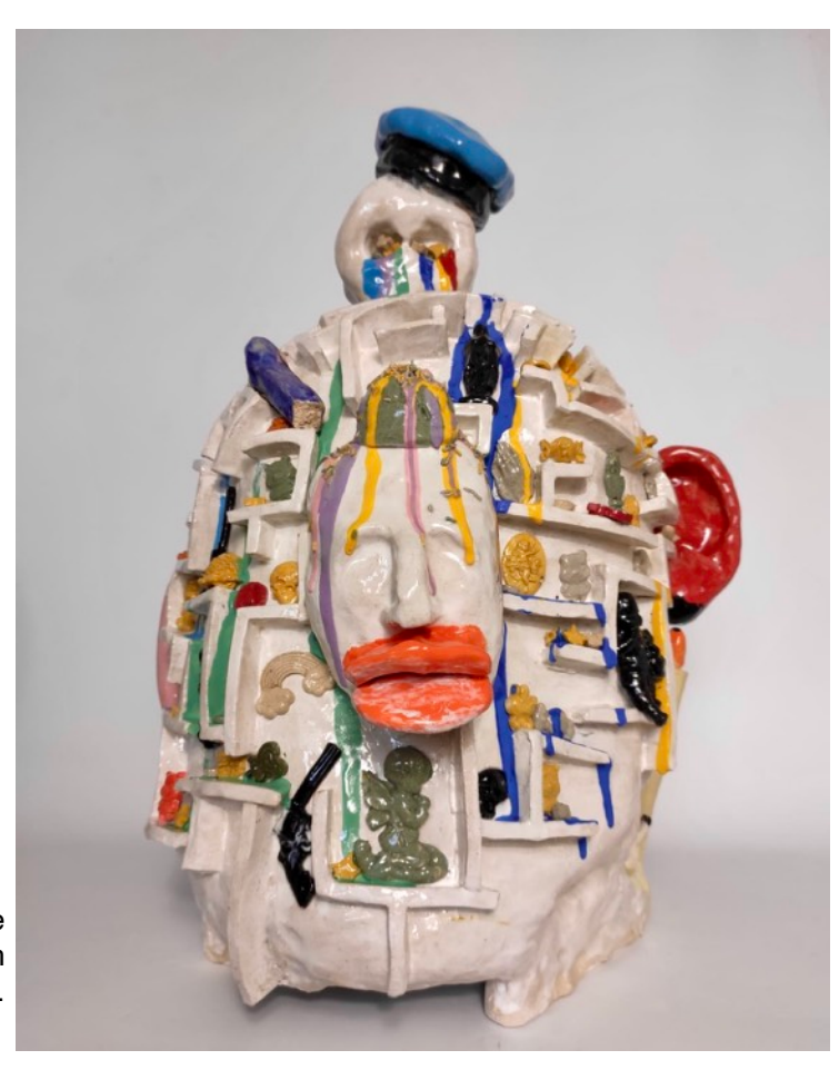
Untitled, 2021 Glazed stoneware 56 x 38 cm 22 x 15 in.