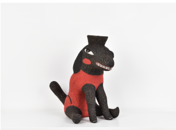
Puppy smiling, 2020

Chamotte clay and underglaze paint - Signed 154 x 54 x 38 cm 60.6 x 21.2 x 14.9 in.