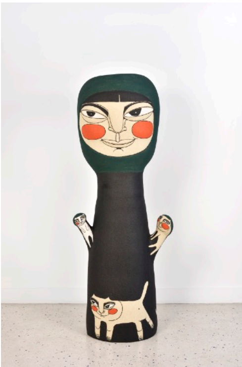
Cat tree, 2020

Chamotte clay, underglaze paint and high firing glaze - Signed 80 x 54 x 55 cm 31.4 x 21.2 x 21.6 in.