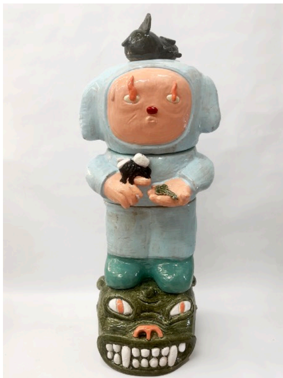
La Llave de Xólotl , 2023 Glazed ceramic 55 x 22 x 19 in. 139,7 x 55,8 x 48,2 cm

NCECA Juried Student Exhibition, Curated by Virginia Scotchie & Salvador Jiménez-Flores; Artspace Gallery, Richmond