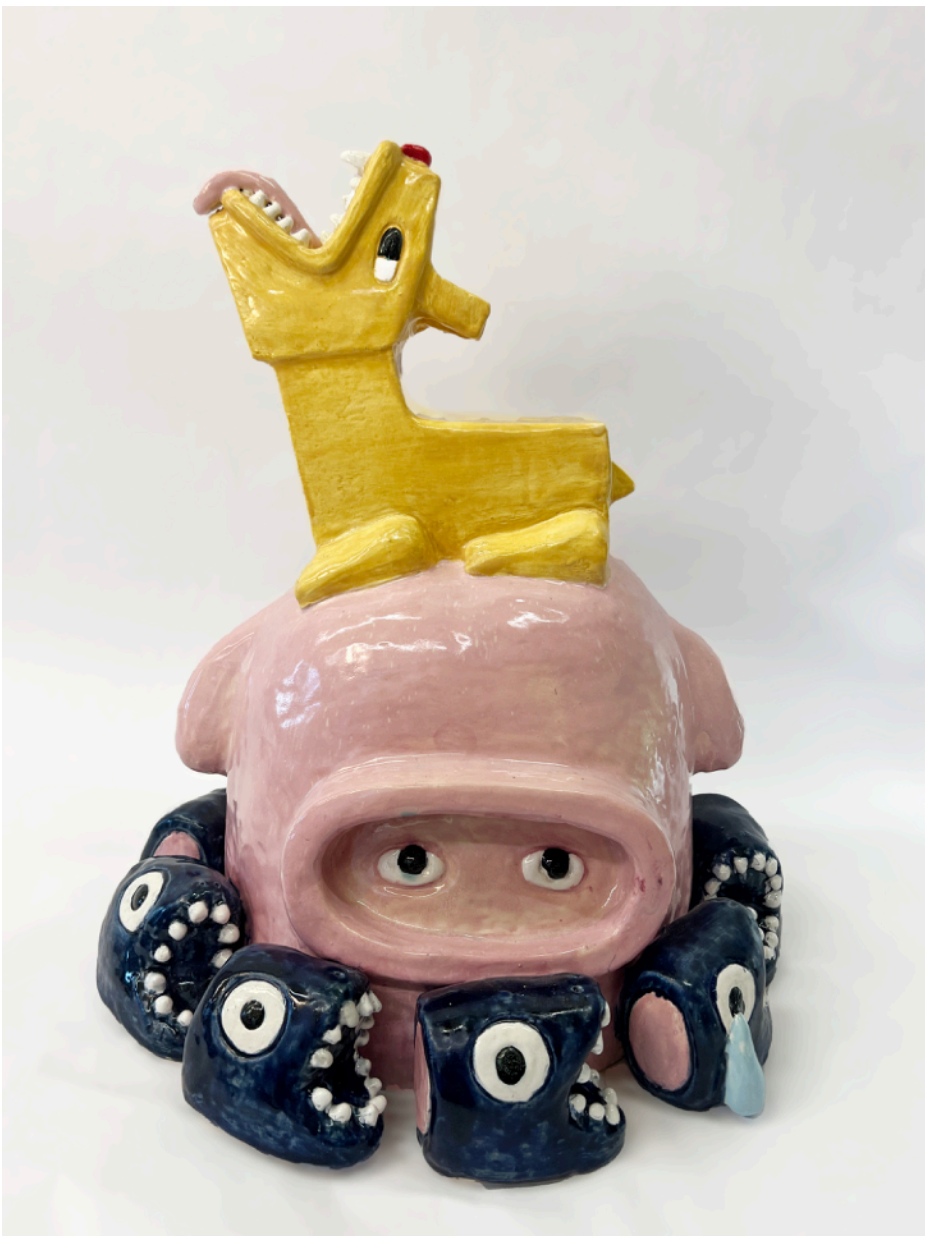
Haenyeo (Sea Women), 2023 Glazed ceramic 21 x 19 x 17 in. 53,3 x 48,2 x 43 cm

As emotive and vibrant as they are large in scale, the Woogies begin as hundreds of pounds of clay. Wedged and flung across the floor, sheets of flesh are assembled into feet, then limbs, then torsos and heads. From flies and ghosts to teeth and arrows, the Woogies are adorned with "lucky symbols". Twenty-first-century talismans functioning as markers of time spent and people loved. Once saturated with enough nostalgia, they are coated in careful combinations of commercial or formulated glazes. In this arduous mania, a new world is created. In turn, the Woogies become clay folk tales reorienting the nature of ceramics into a sentiment that is satirical, critical, and kind.