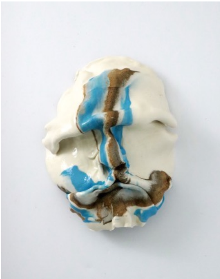
Life Mask LXXI, 2019

Porcelain and stoneware - Signed and dated