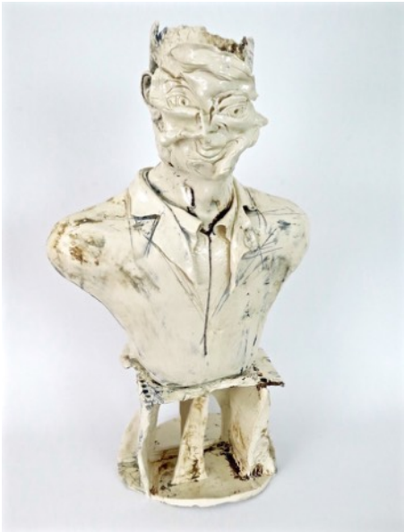
Beneath Their Fantastic Disguise, 2019