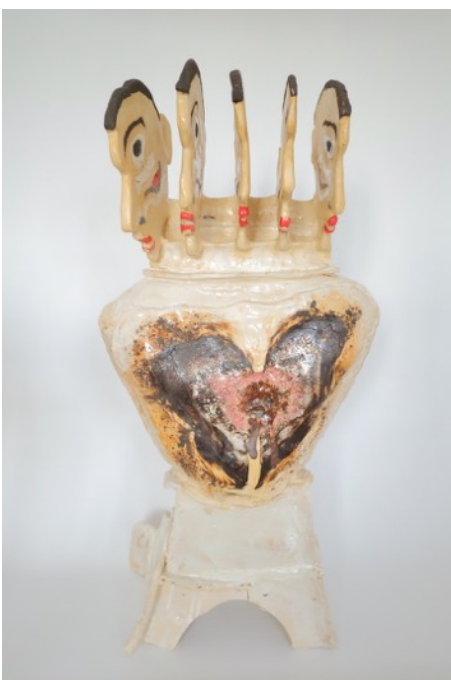
Souls Aren't Like Reptile Tails I'm Afraid II, 2019

Porcelain, stoneware and glaze - Signed and dated