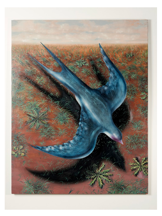
BRIEUC MAIRE DESIRE PATH November 23, 2023 - January 24, 2024